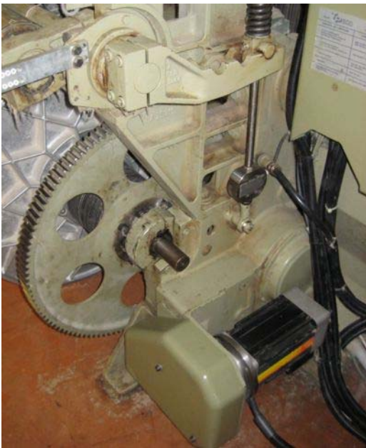
WARP LET-OFF TP600 WM