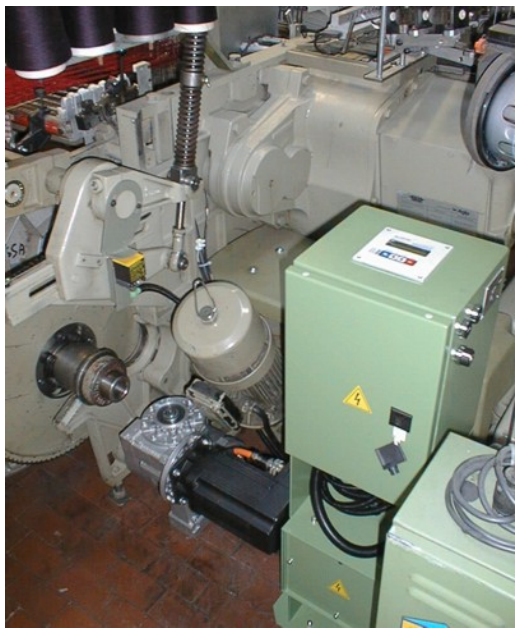
WARP LET-OFF Fast WM