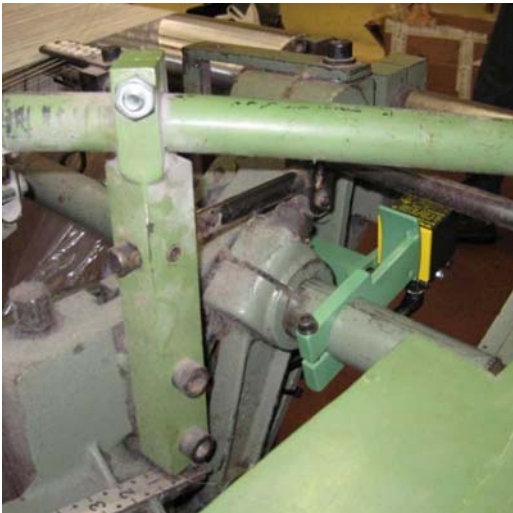
WARP LET-OFF SENSOR S400 WM